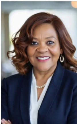
Mayor Marva Campbell-Pruitt

#SaukVillage #WomenInLeadership #CommunityStrong #LeadershipMatters