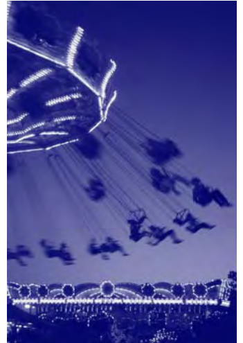
Unlimited Rides Saturday and Sunday