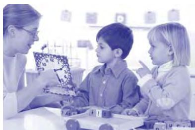
Free Crafts and Education

Emmanuel Church at 22515 Torrence Avenue is having Bible School for ages 4 through 12 on August 4th through 8th from 9:30 a.m. to 11:30 a.m.