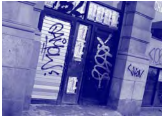
Graffiti Removal Available

The Sauk Village Police Department in cooperation with the Cook County Sheriff's Office is offering free graffiti removal. Those