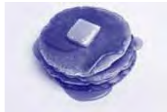
Meet Your Firefighters at the Pancake Breakfast

This is just a small sample of the life saving tips that can be found on NFPA's website. Check it out.