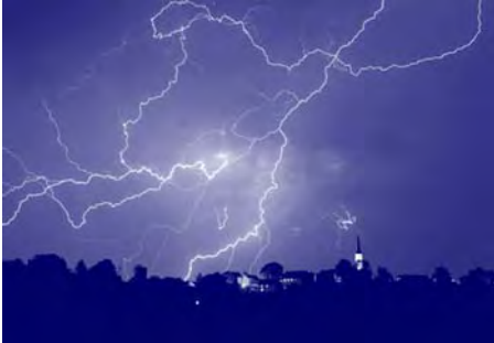
After the Storm, Prepare for Cleanup

We all hate storms, but as the summer progresses there is bound to be storms, some will have heavy rain, heavy winds and other conditions out