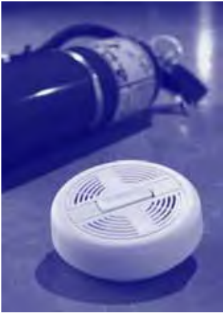
Prevent Home Fires

The week of October 5th-11th, 2008 is National Fire Prevention Week. This year's theme is "Prevent Home Fires." Fire Prevention Week is sponsored by the National Fire Protection Association (NFPA). The NFPA's website contains a