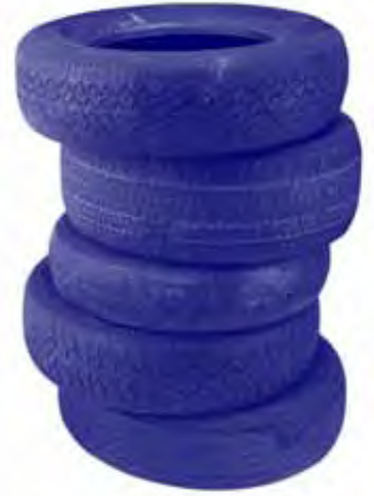
WASTE TIRE COLLECTION