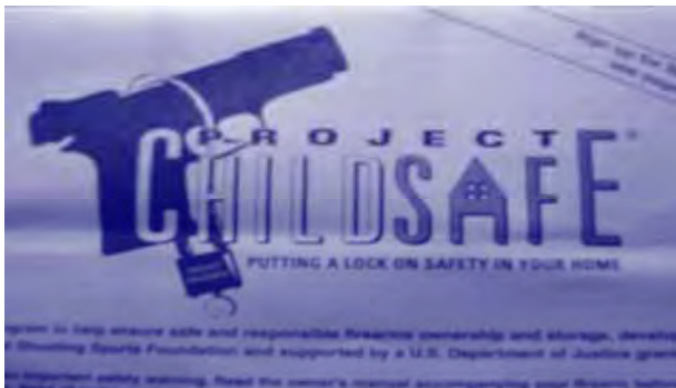
Putting a Lock on Safety in Sauk Village

The Police Department is still offering free gun locks to anyone interested. No questions asked. Adults should visit the police department and ask for these locks. We are asking at this time that you limit your request to 3 locks per adult. These locks come with two keys and the metal cable is plastic coated, keeping scratches from your firearms.