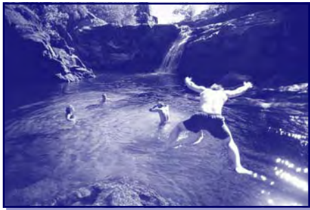
Children Summer Camp