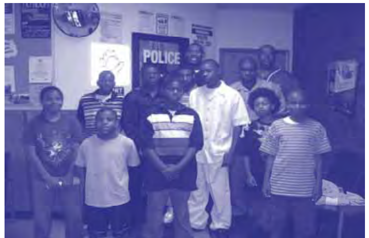
Sauk Camp graduates of 2008