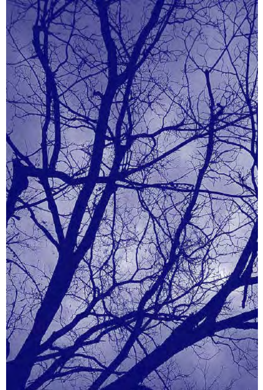
Wood Chips Provided to Residents

of charge to any resident who requests. They are great for gardens and landscaping projects. Please call the village hall to request delivery.