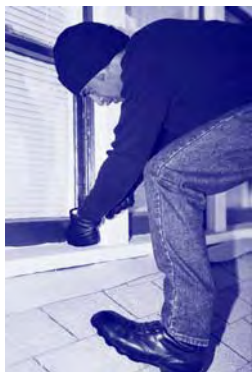
Prevent Uninvited Guests

Put a few lights and a radio on timers set to go on and off at random times during the day and evening. Leaving one light on the entire time you're away is an obvious sign that no one is around to turn it off. Close most of your window shades, but keep a few open on upper floors for light to