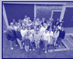
Seeking Thirteen More

The Bloom Trail Class of 1978 has planned their 30 year reunion. The event will be held on Saturday, August 9th at 6:30 pm at the Villa De Bruno in Lynwood, Illinois. Tickets are $50.00 per person and $100.00 per couple. Classmates can RSVP via Classmates.com —Bloom Trail/Class of 1978.