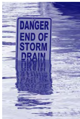
Use Caution on the Streets

Residents are given one week after large storm events to put their branches out; we will not come back after our cleanup dates. When cleanup is complete we end up with a large pile of wood chips which we will deliver free