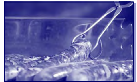
Back-to-School Corn & Dog Roast

SV Parks & Recreations will host its annual back to school Corn & Dog Roast featuring School District 168 on Saturday, August 30th from 3pm – 6pm behind the new Village Hall. Besides the traditional Corn & Dog Roast events; including the crowning of Miss Sauk Village, Junior Miss Sauk Village and Little Miss Liberty. School District 168 has even more games, prizes and activities planned. Mark your calendar to attend this exciting event!